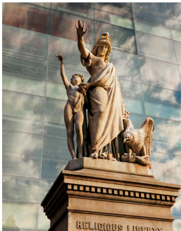
Religious Liberty sculpture in front of the Museum's glass façade Moses Jacob Ezekiel, Religious Liberty , 1876, The City of Philadelphia

Ezekiel's sculpture depicts religious liberty through a group of allegorical figures. The main figure, a woman in classical dress, is Liberty. She wears a Phrygian cap, a symbol of liberty in neoclassical art (the Statue of Liberty also wears one), decorated by thirteen stars, representing the original thirteen colonies. She holds a copy of the United States Constitution in her left hand and stretches her right hand